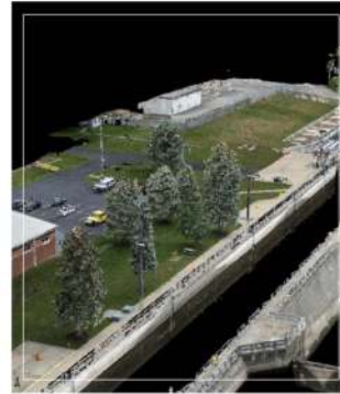
Troy Lock and Dam Bulkhead Recess Rehabilitation Scan